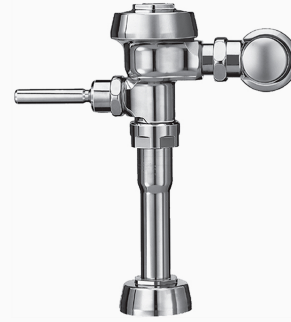
Variation Not Shown: Less Ground Joint